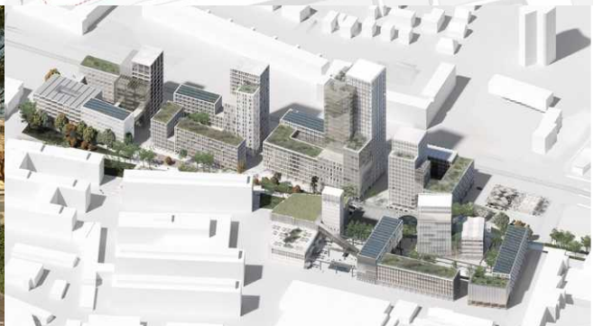
COBE Architects Nordhavn – Lageplan | Geisenhausenerstr. & Boschetsrieder Str. | Isometrie