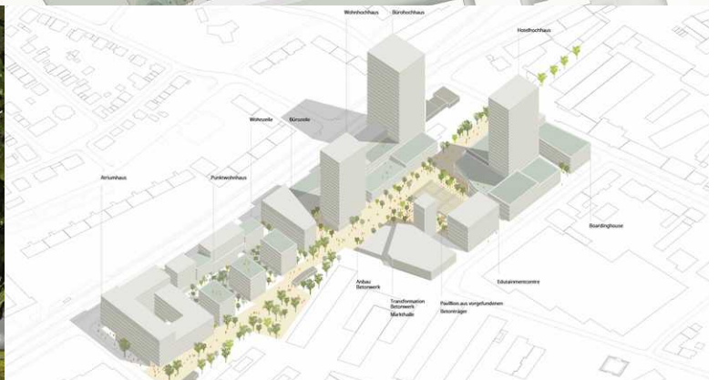
KCAP GmbH mit SLA – Lageplan | Geisenhausenerstr. & Boschetsrieder Str. | Isometrie